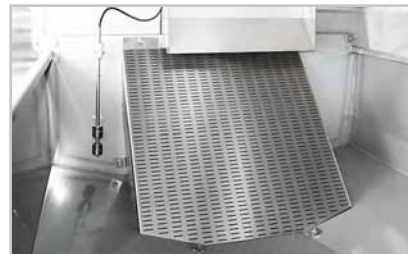
strainer on the pan outlet, level switch