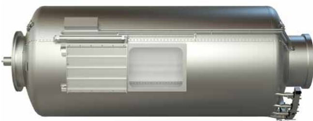
PST drum, hermetic hatch with pneumatic drive